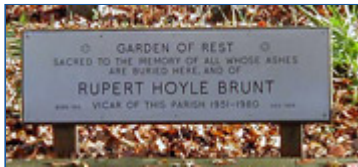
The garden of rest