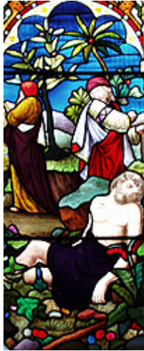
First double window (east end) Parable of the Good Samaritan