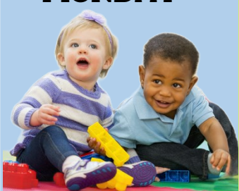
10am-12noon ARK PLAYGROUP For Under 5s and carers. £3 first child. £1 others.