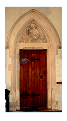
Vestry door with its stone sculpture