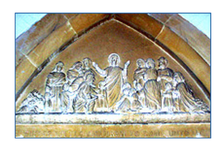
'Suffer Little Children To Come Unto Me' at the west end of the south aisle, above the inside south door