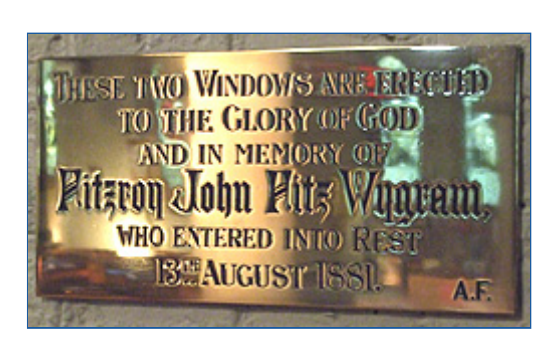
Plaque in memory of Fitzroy Fitz Wygram 1882