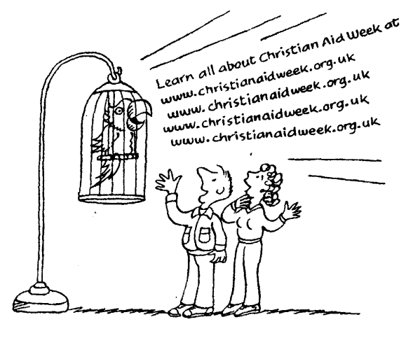
It's amazing what you can get online these days!"

whom have been 'doing' Christian Aid week for many years. A few more collectors could "make a difference" to our team. Please think hard about giving a few hours to Christian Aid Week this year we really need you! Ring me on 8979 3961 if you want more information or if you would like to help to make a difference by distributing and collecting envelopes (it's a good idea to form pairs if you are new) or by counting the money at the end of the week.