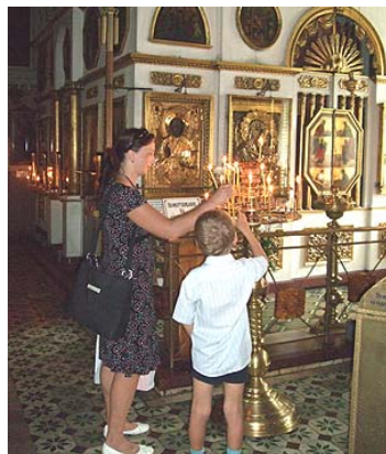
Holy Trinity Church, Moscow

The celebrated Hermitage Museum was also on our itinerary. One of the world's great art galleries, set in the former Winter Palace, it was Catherine the Great's private museum before becoming the first public art museum in Russia in the mid-nineteenth century. We broke away from the guide and found a quiet corner among the impres-