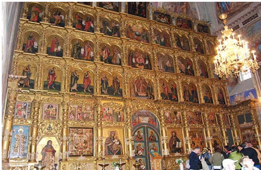
The iconostasis in the Transfiguration Cathedral in Uglich