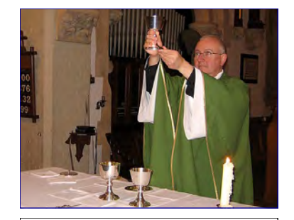
He told them that he must die to save the world and they must always share the bread and wine to remember him.

Put the lines of the song in the right order