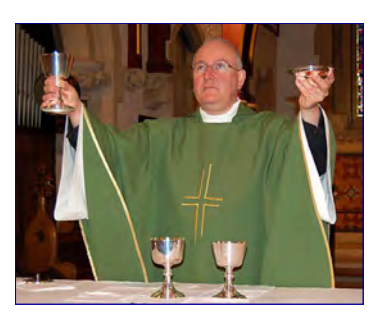
When Jesus had the Last Supper he took some bread, broke it and shared it with the disciples.

• Match the pictures with the descriptions.