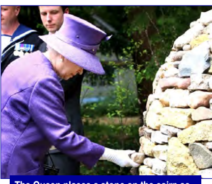
The Queen places a stone on the cairn as part of commemorations to mark the 25th anniversary of the end of the Falklands war

This was a very unexpected discovery but one which we found very moving. It is possible to visit the Chapel in the school grounds and details are on their website as well as photos of the altar window.