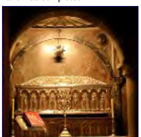
► The tomb of St James

The cathedral is one of the finest Romanesque churches in Spain. Construction began in 1060 in the reign of Alfonso VI and was completed in 1211.