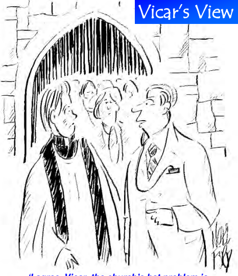
'I agree, Vicar, the church's bat problem is getting worse - all that high-frequency squeaking is interfering with my iPod

For the pot luck lunch, please bring something from the following: cheese; cold meats; salads (pasta, couscous, rice or green); and juice or other soft drinks; and cakes or biscuits from the children.