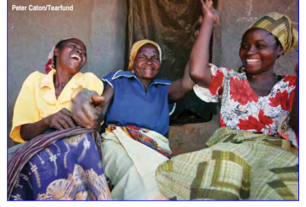
Volunteers from local churches in Mozambique are trained to help neighbours living with HIV

Tearfund was founded in 1968 and has grown to become one of the UK's leading development agencies tackling the causes and consequences of poverty. Working through partners and networks in the UK and over 50 countries, assistance is always provided on the basis of need alone. Individuals are not discriminated against on grounds of their gender, age, ethnic origin, sexual orientation or religious beliefs. Tearfund's priority areas include HIV;