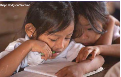
Tearfund helps children, like these in Cambodia, receive an education to help them out of poverty

I find, all around me, people giving their all to enable, empower and transform the situation of those most in need. Tearfund staff enjoy being where they are and doing what they do. Fairtrade is the norm. Staff are also 'carbon conscious', many (including those at the top) choosing to come to work by public transport or by bike. Great emphasis is placed on learning, both by staff and the wider organisation. I find, over lunch, that one director's PA has a PhD in classics and an Egyptian friend is about to embark on postgraduate study on the role of women in the Arab Spring. Four colleagues are completing Masters with the Open University and another is setting up a training partnership between Tearfund's Disaster Management Unit and the Disaster Management Centre at the University of Coventry. Transparency is championed and Tearfund reviews its work continually, trying to embed the learning from the field into future development planning.