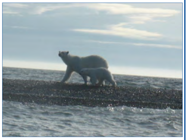
My wish was granted when I saw this mother and baby polar bear

The flora on these islands is minimal. This is because there is only a thin layer of soil above the permafrost. It is like walking on a miniature garden. No trees, but maybe a couple of stunted bushes.