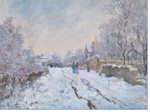
The scene is of a road with trees and buildings each side and a few pedestrians. Details are sacrificed for the atmosphere of a grey winter's day. The Frenchman paints exactly what he sees which gives the painting great immediacy. Monet was a leading Impressionist, a movement which broke away from historical paintings favoured by the Salon, as happened earlier with Constable. This school became very popular. The painting was bequeathed in 2006 by Simon Sainsbury.

Snow Scene at Argenteuil, 1875, Claude Monet (1840-1926)