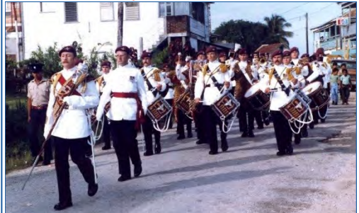
My last tour before leaving the Army was in Ghana. We were asked to give a concert in Accra, but it was cancelled at the last minute. We were all dressed up with nowhere to go! Our bandmaster asked the driver to take us out of the city to the nearest village, where we set up and gave a concert to anyone who cared to listen. It was a huge success! One of the pieces we played was Otto Nicolai's overture to his opera, which had premiered in 1849 in Berlin.